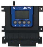
MHR RADIO CONTROLLER

Setting a new standard in performance, dependability, and value, the inteleSmart2 Receiver is well suited to a variety of applications and industries. It can be customized with several frequency options, analog and digital inputs, and has the ability to add additional relays if required.