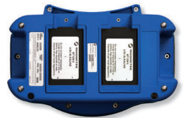
Main battery and spare battery packs